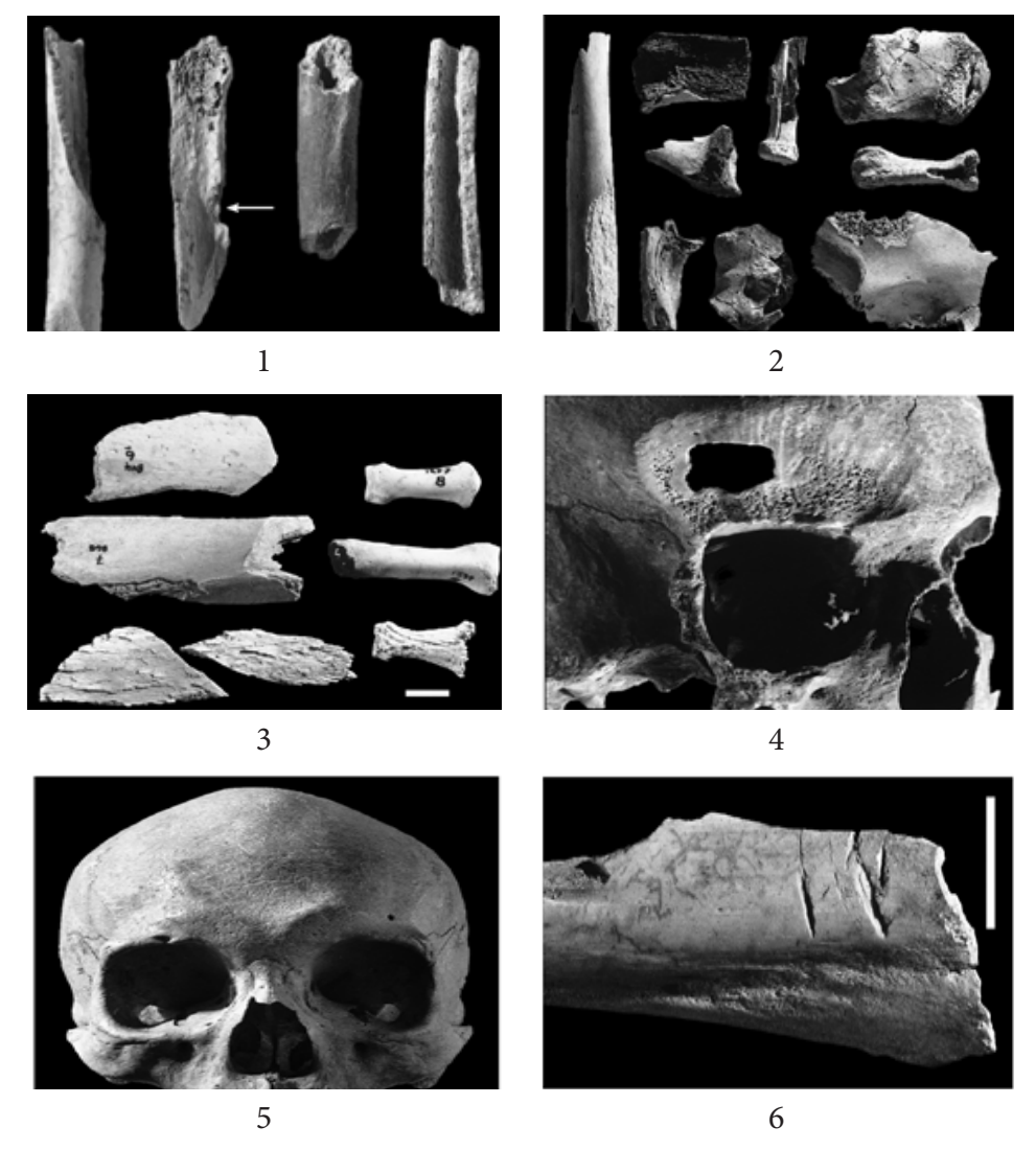
Figure 2. 1- Peri-mortem (left) and post-mortem (right) fractures of human femoral shafts; 2-Burned human bone; 3- Burning and weathering of bone; 4- Highly patterned rodent gnawing

Peri-mortem traces are physical evidence of activity immediately before, during or after death (Burns, 2012). They help experts in investigating causes and ways of death (murder, suicide or accident) and can help determine the intentions of the murderer. Also, in osteological analysis, it is necessary to identify bone injuries from the normal state and to distinguish between injuries caused by pathological and taphonomic agents (Skinner, Alempijević, & Đurić-Srejić, 2003). The most important contribution of osteologists in forensic research is the explanation of all potential solutions and opportunities for better collaboration with the research team (Ubelaker, 1989).