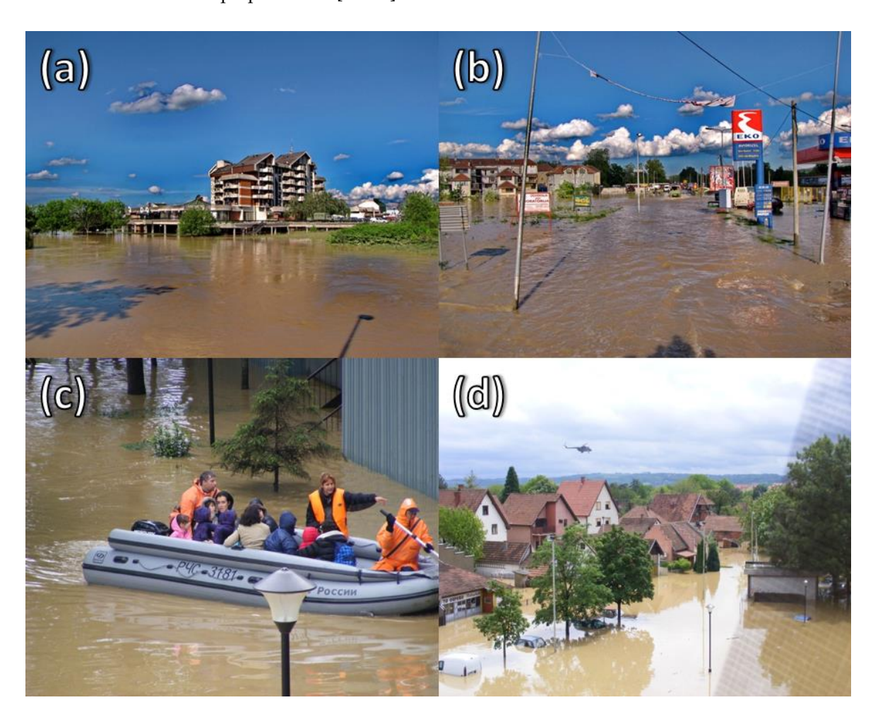
Figure 2. The most critical flood event occurred in 2014 in Serbia. (a) flooded hotel in Obrenovac; (b) flooded streets in Obrenovac; (c) citizen evacuation in Obrenovac; (d) rescue helicopter in Obrenovac.

In the period from 1915 to 2013, 848 flood events accounting for 133 deaths were registered [58]. In detail, the events with the most impact occurred in the Kolubara (June 1996; May 2011), Great Morava (July 1999), Kolubara and Drina (June 2001), South Morava (November 2007), West Morava, Drina and Lim (November 2009), Great Timok (February 2010), Pèinja (May 2010), and Drina (December 2010) watersheds [57]. The most critical event occurred in May 2014 (Figure 2), affecting the territories of Serbia, Bosnia-Herzegovina, and Croatia [60]. The precipitation exceeded 200 mm in a day and was the most dramatic event registered since 1961 [61], affecting more than 1.6 million people (22% of the country's population) [60]. However, the evacuation procedures were difficult to manage because of the failure of people to move away from hazard areas. Such reactions highlighted a general mistrust of individuals in localities within the government's actions, including evacuations, coupled with low levels of awareness and preparedness [62–64].